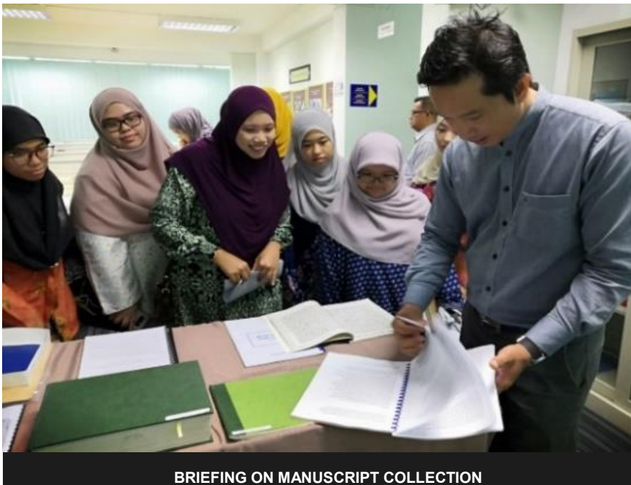
BRIEFING ON MANUSCRIPT COLLECTION