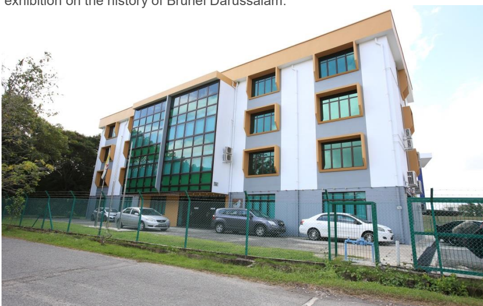
THE BORNEO RESEARCH CENTRE BUILDING IN ANGGEREK DESA